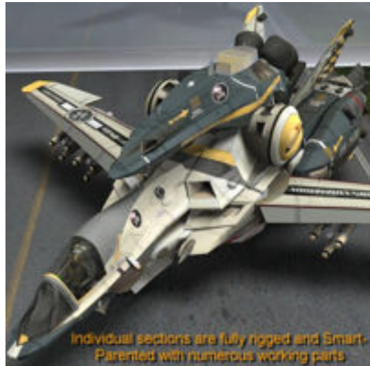
Individual sections are fully rigged and Smart-Parented with numerous working parts