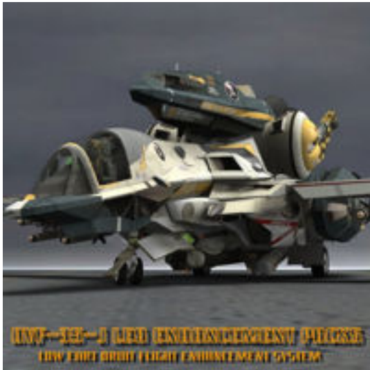
F-16 (LOW ENHANCEMENT) PHOTOS LOW ENHANCEMENT FLIGHT ENHANCEMENT SYSTEM