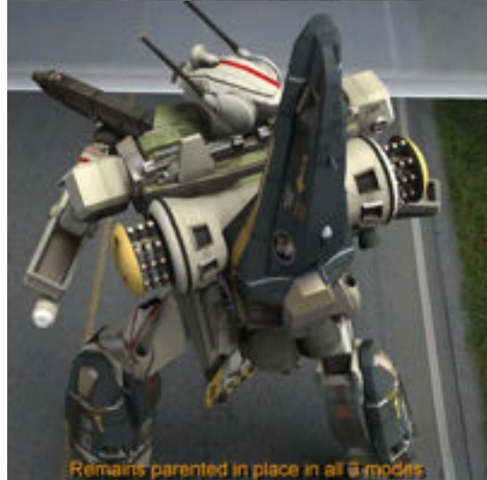
Remains parented in place in all @-modes