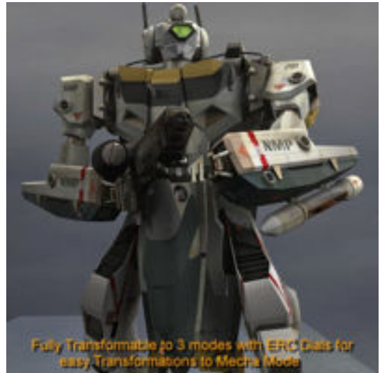
Fully Transformable to 3 modes with ERC Dials for easy Transformations to Mecha Mode