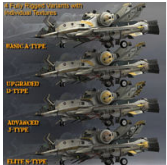
4 Fully Rigged Variants with Individual Textures