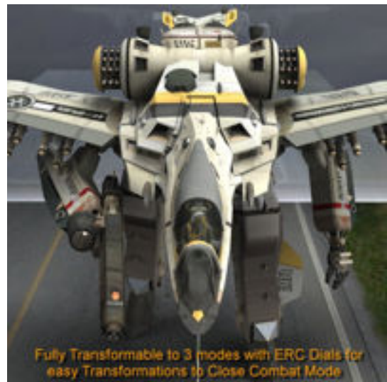
Fully Transformable to 3 modes with ERC Dials for easy Transformations to Close Combat Mode