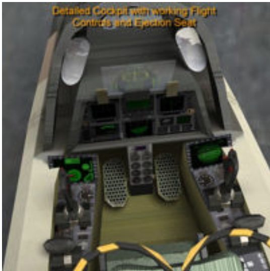
Detailed Cockpit with working Flight Controls and Ejection Seat