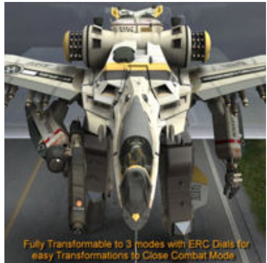
Fully Transformable to 3 modes with ERC Dials for easy Transformations to Close Combat Mode