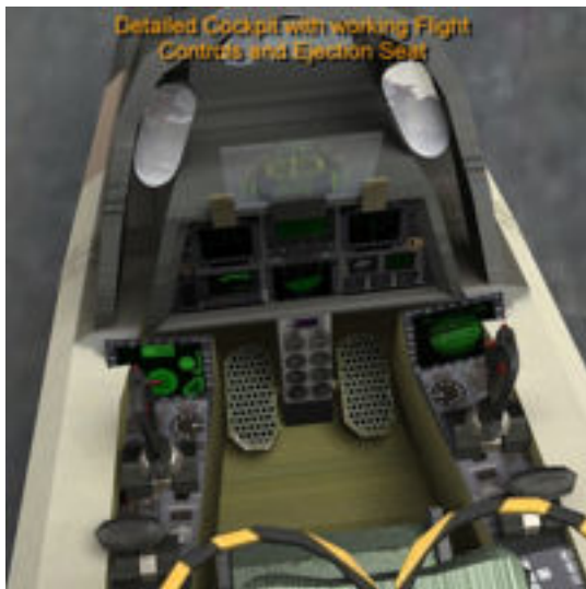
Detailed Cockpit with working Flight Controls and Ejection Seat