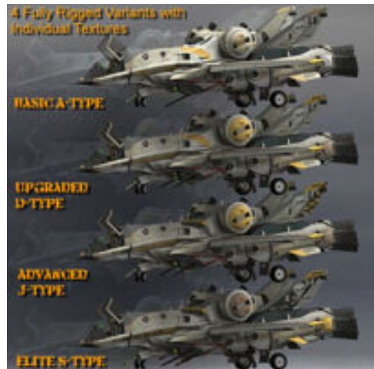
4 Fully Rigged Variants with Individual Textures